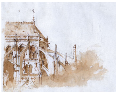
Pen and Ink