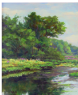
Marsh Garden- 18x15 oil on panel