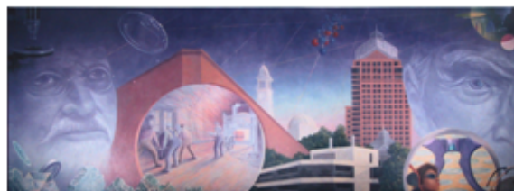
Focal Points ~ The Epic of Bausch & Lomb 71/2ftx 21ft Acrylic on Canvas mounted to wall